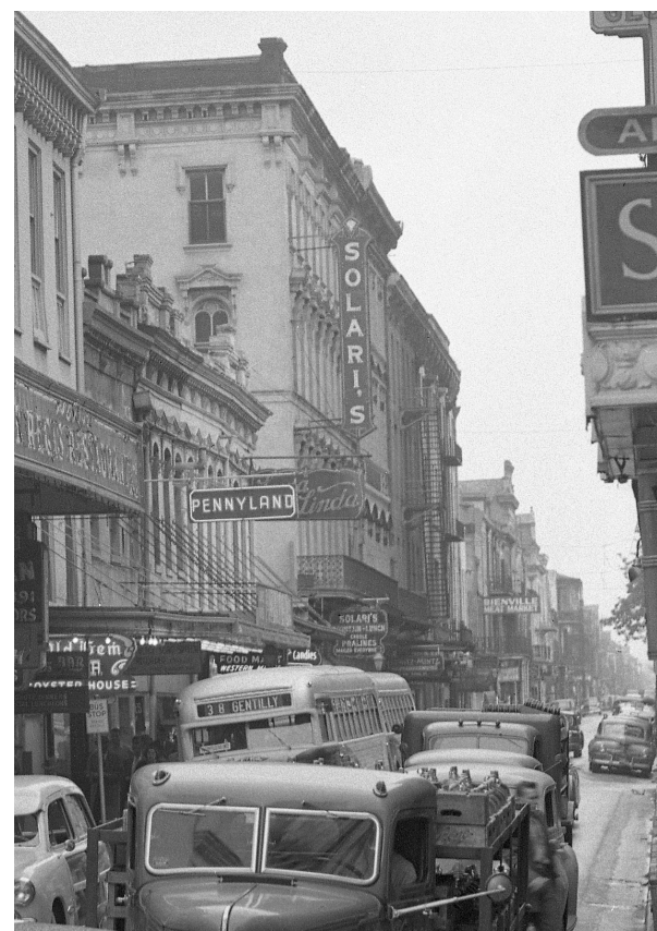
ABOVE: Solari's in the late 1940s. TOP: Inside Solari's in the 1940s.